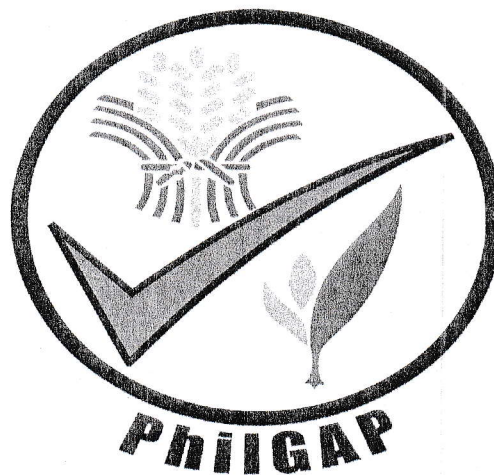
Figure 1. PhilGAP Certified Mark

The PhilGAP Certified Mark (Figure 1) shows the basic design elements of the certification mark, the PhilGAP logo with the text "PhilGAP" situated at the bottom of the circle. The logo of the Department of Agriculture (DA) at the upper left corner of the circle, the logo of the Bureau of Plant Industry (BPI) at the lower right corner of the circle and with the check mark at the center with green color and black line indicating conformities to standards, the DA logo indicating its respective original color of yellow and green; the BPI logo indicating its respective yellow, green and light green and; and black for the circle enclosing the logo and the inscription "PhilGAP". The type face use is Impact Regular for the word "PhilGAP".