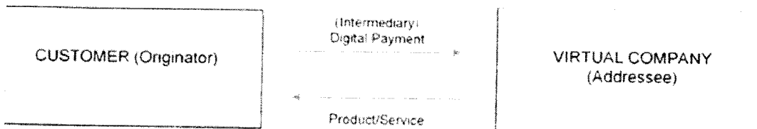
Figure 1. Digital Payment Scheme